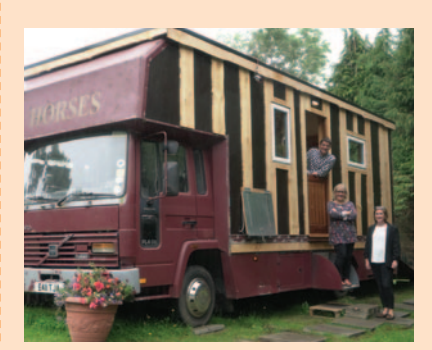
Sisters of Send Mountain Bike Festival,