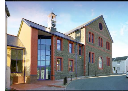
The Royal Cwmaman Hall

Abercwmboi has retained its identity and not been developed as have many other Cynon Valley villages. As a result, is a very close and friendly community. Many families continue to remain within the community and have a great sense of belonging. Abercwmboi RFC offer a venue for community functions and have teams supporting junior rugby, senior rugby and women's rugby.