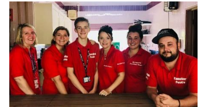
The team at Canolfan Pentre