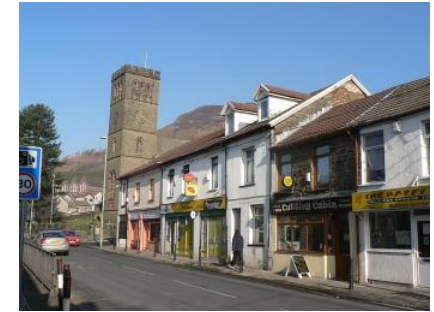
Llewelyn Street and St Peter’s Church

There are a variety of community facilities and amenities within close proximity of each other. These include Canolfan Pentre, Salvation Army, the Bowls Club and St Peter’s Church. £81,435 from the Pen y Cymoedd Wind Farm Community Fund has been awarded to Canolfan Pentre to support the installation of a MUGA (Multi Use Games Area) just behind this popular community venue. These centres provide lots of activities for community members. Pentre also has a few shops, petrol station, a pub and a night club. With a children’s park and 3G football pitch at the centre of the village. The 3G pitch can only be used by appointment through the council and Cardiff City children’s development teams are using the pitch weekly.