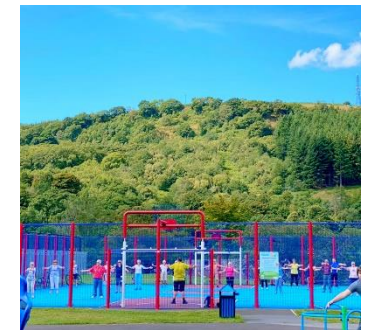
MUGA at Pentre Park