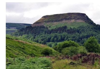
Treherbert Volunteer Gardening Group