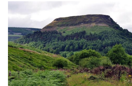
Treherbert Volunteer Gardening Group