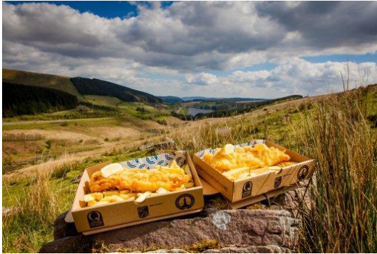
Penaluna's Fish and Chips in Hirwaun

Hirwaun, the meaning in Welsh language as "Long Meadow" is a village and community at the north end of the Cynon Valley in the County Borough of Rhondda Cynon Taf, South Wales. It is 4 miles North West of the town of Aberdare, and comes under the Aberdare post town. The Village is on the heads of the valleys road and at the southern edge of Brecon Beacons National Park.