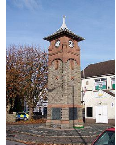
Hirwaun War Memorial

Hirwaun has an industrial heritage which the Hirwaun Ironworks were the centre of. After the ironworks closed coalmining became the prominent employment for the residents in Hirwaun until the late 20 th century.