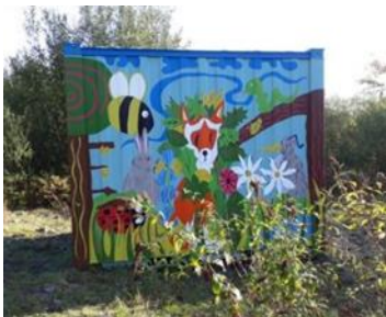
Craig Gwladus Woods