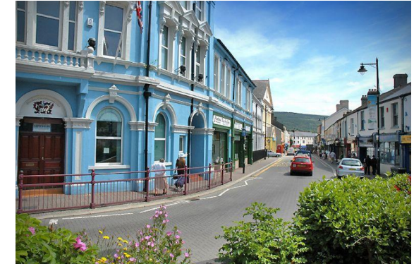
Aberdare Constitutional Club in Aberdare Town

improvements were made to the town, which became a pleasant place to live, despite the nearby collieries.