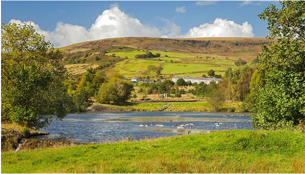
Dare Valley Country Park

Aberdare is a town in the Cynon valley area of Rhondda Cynon Taf. Aberdare is 4 miles south-west of Merthyr Tydfil, 20 miles north west of Cardiff and 22 miles east north east of Swansea. During the 19th century it became a thriving industrial settlement, which was also notable for the vitality of its cultural life and as an important publishing centre. From the 1870s onwards, the economy of the town was dominated by the coal mining industry, with only a small tinplate works. There were also several brickworks and breweries. During the latter half of the 19th century, considerable